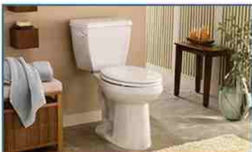
Sanitation Facility For Servant & Drivers