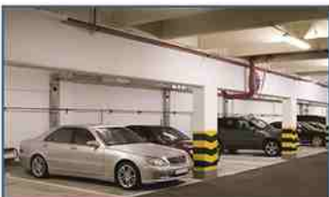
Full Covered Parking