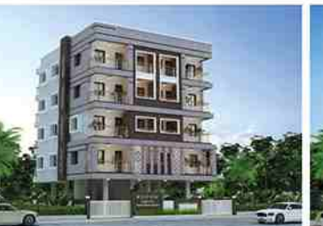
WESTSIDE Rathod Layout, Anant Nagar, Nagpur.