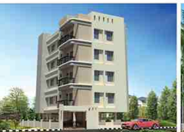
Kamgar Nagar, Police Line Takli, Nagpur.