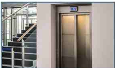
Automatic Lift With Power Backup