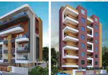
EAST AVENUE Rathod Layout, Anant Nagar, Nagpur.