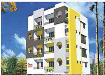
GALAXY HEIGHT Gorle Layout, Police Line Takli, Nagpur.