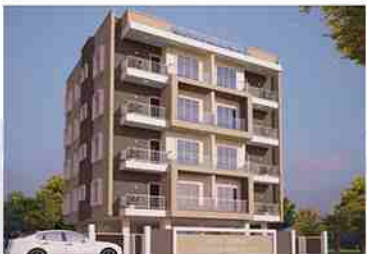
WEST AVENUES Ayyappa Nagar, Nagpur.