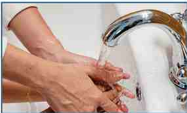
24/7 water supply