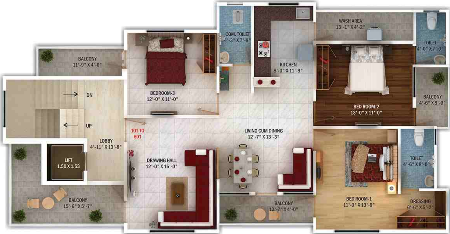
TYPICAL 1ST TO 6TH FLOOR PLAN