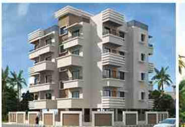
THE GALLERIA Rathod Layout, Anant Nagar, Nagpur.