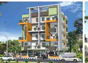
THE AVENUES Ahhbab Colony, Police Line Takli, Nagpur.