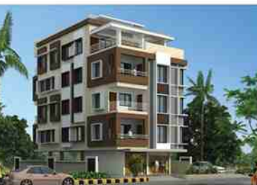
THE CORE Main Road, Police Line Takli, Nagpur.