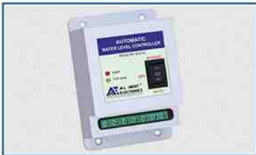
Automatic Water Level Controller