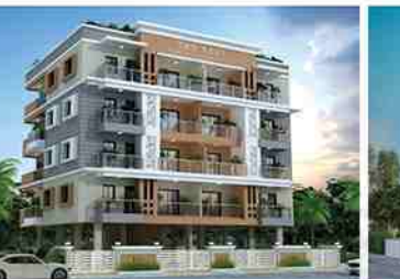
THE NEST Khan Co-Operative Society, Nagpur.