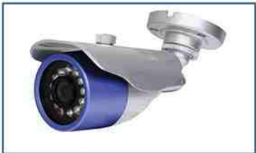
CCTV Surveillance For Common Area