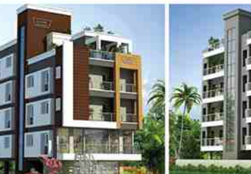
LINK APARTMENT Near C.I.D Office, Nagpur.